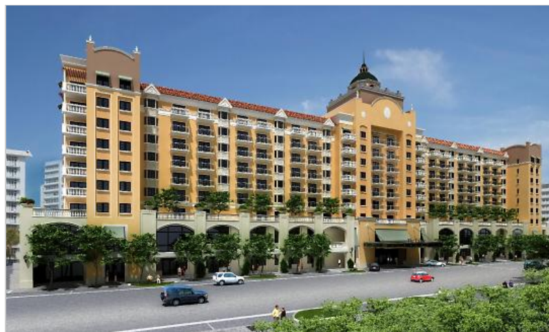
Above: Rendering of The Palace at Coral Gables